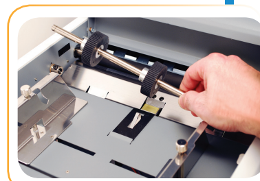
Removable Feed Wheels

Formax - New Hampshire, USA www.formax.com