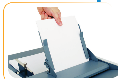
Optional Multi-Sheet Feeder